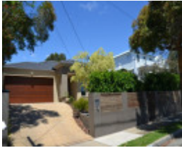
33 Upper Skene Street, Newtown