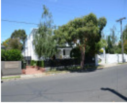
35 Upper Skene Street, Newtown