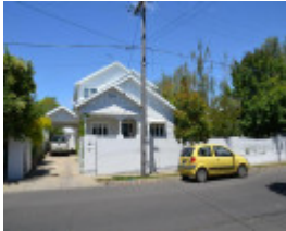
37 Upper Skene Street, Newtown