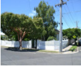
39 Upper Skene Street, Newtown