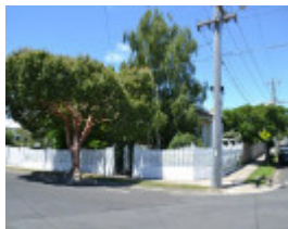
39 Upper Skene Street, Newtown