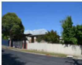
41 Upper Skene Street, Newtown