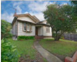
43 Upper Skene Street, Newtown