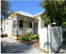
45 Upper Skene Street, Newtown