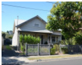
47 Upper Skene Street, Newtown