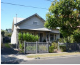
47 Upper Skene Street, Newtown