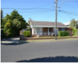
49 -(1) Upper Skene Street, Newtown