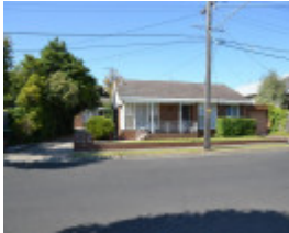
49 -(1) Upper Skene Street, Newtown