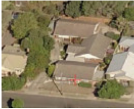
49- (3) Upper Skene Street, Newtown