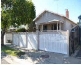
51 Upper Skene Street, Newtown