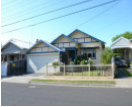
53 Upper Skene Street, Newtown