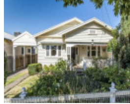
55 Upper Skene Street, May 2015. Real Estate online http://www.realestate.com.au