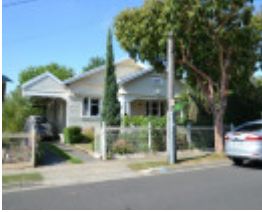
55 Upper Skene Street, Newtown