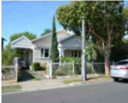
55 Upper Skene Street, Newtown