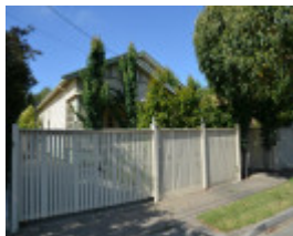
57 Upper Skene Street, Newtown