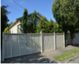
57 Upper Skene Street, Newtown