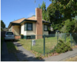
59 Upper Skene Street, Newtown