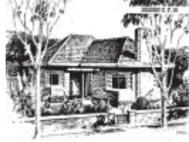
'Design C.F.10' in Designs for Homes under Credit Foncier, Loan Conditions, State Savings Bank of Victoria, Jan 1940.