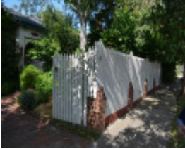
61 Upper Skene Street, Newtown