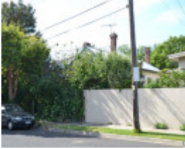
63 Upper Skene Street, Newtown