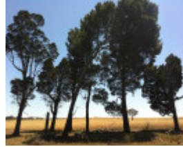
Callitris glaucophylla (White Cypress-pine), Anakie