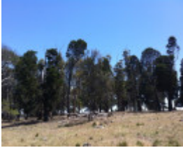
Callitris glaucophylla (White Cypress-pine), Anakie