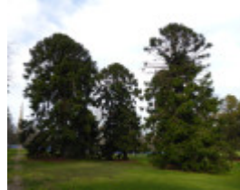
Araucaria bidwillii, South Yarra.