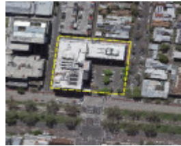
Aerial photo of the place showing registered extent