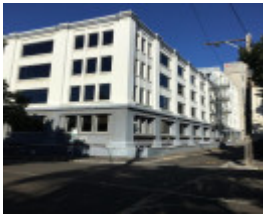
1931 building, view from corner of Little Victoria and Napier streets