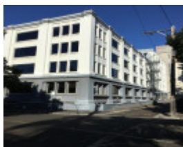
1931 building, view from corner of Little Victoria and Napier streets