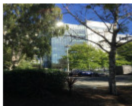
view from corner of Napier Street and Victoria Parade looking NW