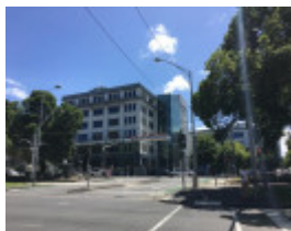
1924 building fronting Victoria Parade