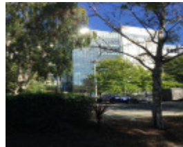
view from corner of Napier Street and Victoria Parade looking NW