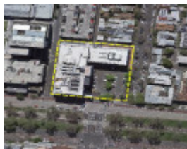
Aerial photo of the place showing registered extent