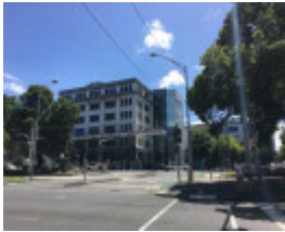
1924 building fronting Victoria Parade