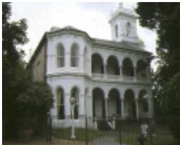
1 cullymont selwyn street canterbury front view