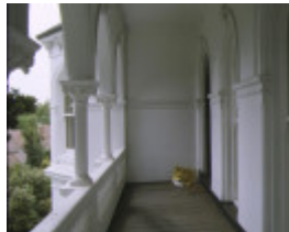
cullymont selwyn street canterbury balcony