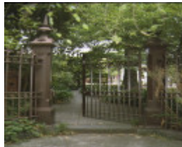
cullymont selwyn street canterbury entrance gates