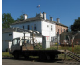
CULLYMONT SOHE 2008