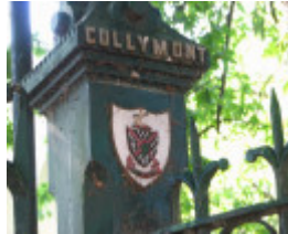
CULLYMONT SOHE 2008