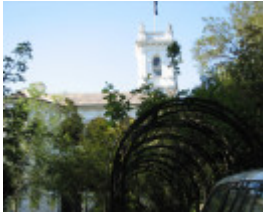
CULLYMONT SOHE 2008