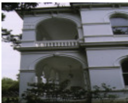
cullymont selwyn street canterbury side view