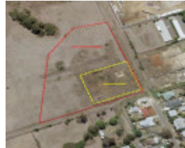
kilmore brewery air photo and recommended extent.JPG