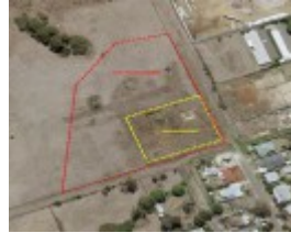
kilmore brewery air photo and recommended extent.JPG