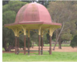
H2095 Eastern Park 29 10.2005 Former Ladies Kiosk