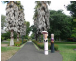
EASTERN PARK & GEELONG BOTANIC GARDENS SOHE 2008