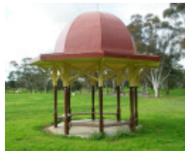
After Photographs - Reference F3903 2016