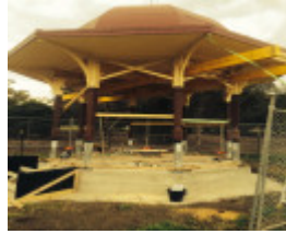
During Photographs - Reference F3903 2015