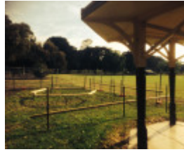
Before Photographs - Reference F3903 2015