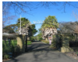
H2095 Geelong Bot Gardens 8.2005 Entry Gates