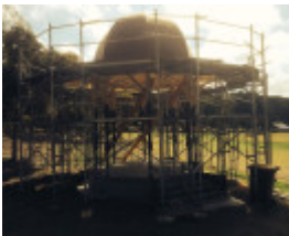
During Photographs - Reference F3903 2015