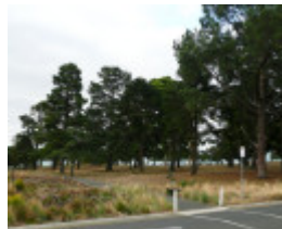
EASTERN PARK & GEELONG BOTANIC GARDENS SOHE 2008