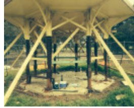
During Photographs - Reference F3903 2015