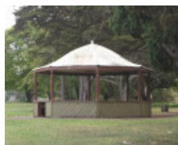
H2095 Eastern Park 10.2005 rotunda