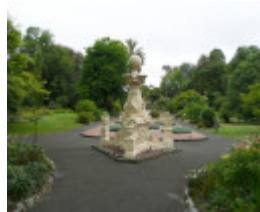
EASTERN PARK & GEELONG BOTANIC GARDENS SOHE 2008