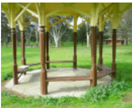
After Photographs - Reference F3903 2016