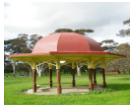
After Photographs - Reference F3903 2016