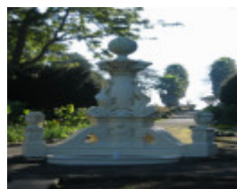
H2095 Geelong Bot Gardens 8.2005 Hitchcock Fountain