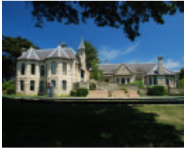
BARRAGUNDA SOHE 2008