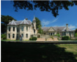
BARRAGUNDA SOHE 2008