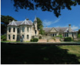
BARRAGUNDA SOHE 2008