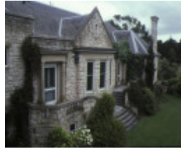
barragunda cape schanck road cape schanck new wing dec1984