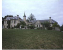
1 barragunda cape schanck road cape schanck view of property dec1984