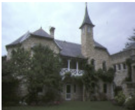
barragunda cape schanck road cape schanck rear view dec1984