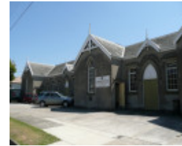
NOBLE STREET UNITING CHURCH, HALL AND KINDERGARTEN SOHE 2008