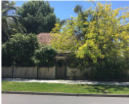
House, 18A Henry Street