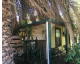
House, 18A Henry Street