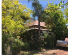
House, 18A Henry Street