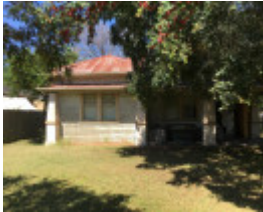
House, 39 Main Street