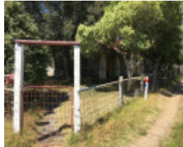
House, 39 Main Street