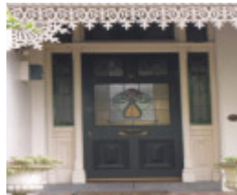
3 and 5 Avondale Road Figure 5 Early twentieth- century door and leadlights at 5 Avondale Road. (source: Context, 2017).jpg