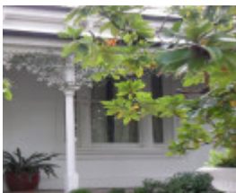
3 and 5 Avondale Road Figure 6 Original front window at 3 Avondale Road with dogtooth moulding below sill..jpg