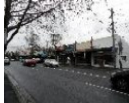
CANTERBURY ROAD COMMERCIAL PRECINCT west