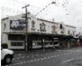
CANTERBURY ROAD COMMERCIAL PRECINCT east