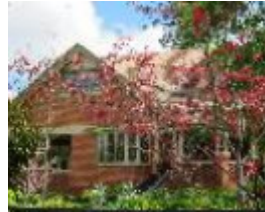
21 Rochester Road.jpg