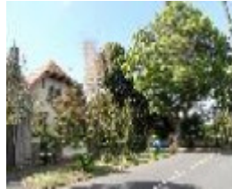
BELLETT STREET PRECINCT street.jpg