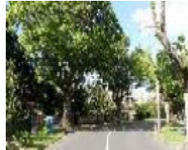
BELLETT STREET PRECINCT street.jpg