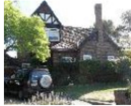
458 Camberwell Road.jpg