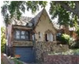
470 Camberwell Road.jpg