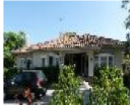
460 Camberwell Road.jpg