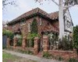
HAMPTON GROVE PRECINCT street.jpg