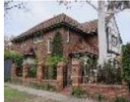
HAMPTON GROVE PRECINCT street.jpg