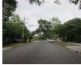
WAR SERVICE HOMES PRECINCT street.jpg