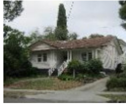
1 Acacia Street (contributory place).jpg