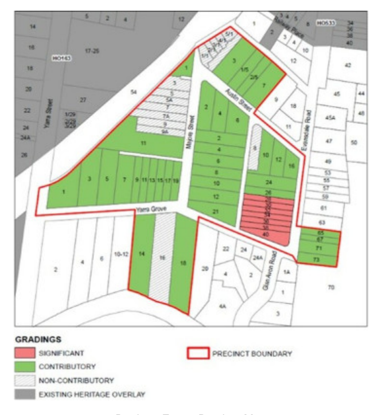
Rookery Estate Precinct Map