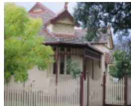
3 Manchester Street.jpg