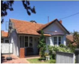
18 Hale Street.jpg