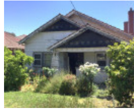
7 Hale Street.jpg