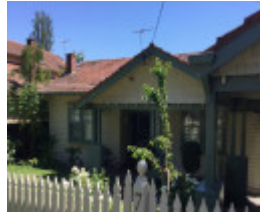
7 Minto Street.jpg