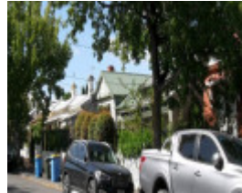
South side of Caroline Street.jpg