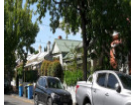
South side of Caroline Street.jpg