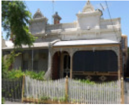
17-19 Carnarvon Street.jpg