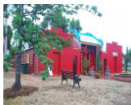
BENDIGO CHINESE TEMPLE SOHE 2008