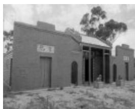
1 bendigo chinese temple finn street bendigo front