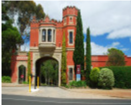
MOONDAH GATEHOUSE SOHE 2008