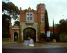
1 moondah gatehouse front june00