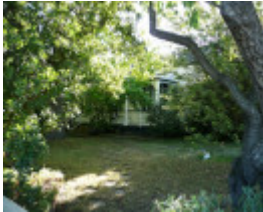
KEYHAM SOHE 2008