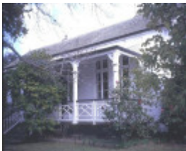
h01128 keyham pakington st and cnr aphrasia and somers newtown front verandah she project 2003