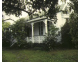
1 keyham pakington street newtown front view jul1995