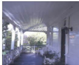
h01128 keyham pakington st and cnr aphrasia and somers newtown verandah she project 2003