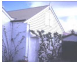
h01128 keyham pakington st and cnr aphrasia and somers newtown stables she project 2003