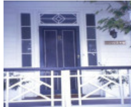
h01128 keyham pakington st and cnr aphrasia and somers newtown front door she project 2003