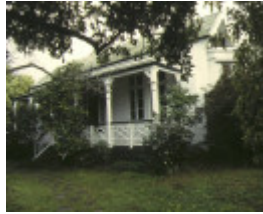
1 keyham pakington street newtown front view jul1995