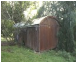
1 prefabricated iron cottage mt duneed road mt duneed front view jun1995