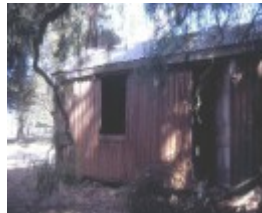
h01131 prefabricated iron cottage mt duneed rd mount duneed front left aspect she project 2003