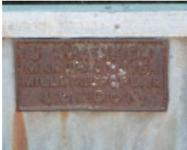
PREFABRICATED IRON COTTAGE SOHE 2008