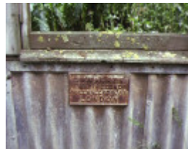
1 prefabricated iron cottage inverleigh detail of manufacturers label