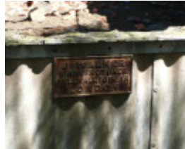
PREFABRICATED IRON COTTAGE SOHE 2008