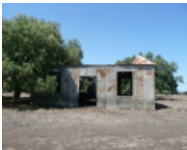
PREFABRICATED IRON COTTAGE SOHE 2008