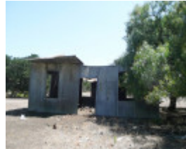
PREFABRICATED IRON COTTAGE SOHE 2008