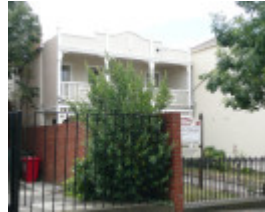
EUDOXUS SOHE 2008