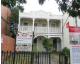
EUDOXUS SOHE 2008