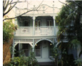
1 eudoxus gelang front view jul1995