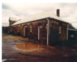
1 mount hesse homestead mount hesse estate road winchelsea stables