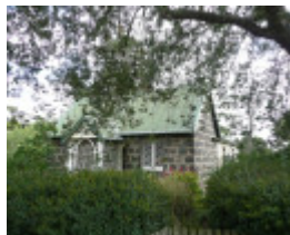
MOUNT HESSE STATION SOHE 2008