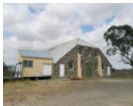
MOUNT HESSE STATION SOHE 2008