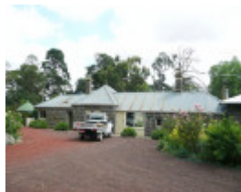
MOUNT HESSE STATION SOHE 2008