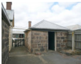
MOUNT HESSE STATION SOHE 2008