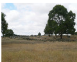
MOUNT HESSE STATION SOHE 2008