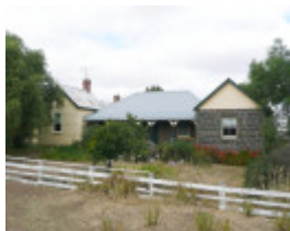
MOUNT HESSE STATION SOHE 2008