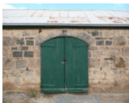
MOUNT HESSE STATION SOHE 2008