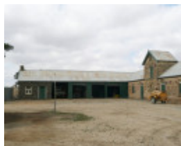
MOUNT HESSE STATION SOHE 2008