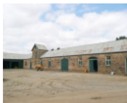
MOUNT HESSE STATION SOHE 2008