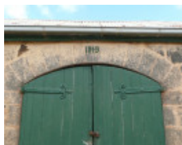
MOUNT HESSE STATION SOHE 2008