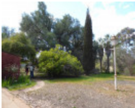
garden to east of homestead Sept 2015.JPG