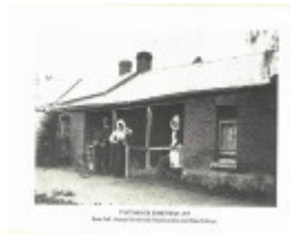
1879 image of 1846 homestead.jpg