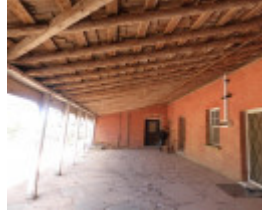
verandah of 1854 addition Sept 2015.JPG