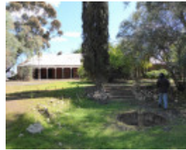
homestead from east Sept 2015.JPG