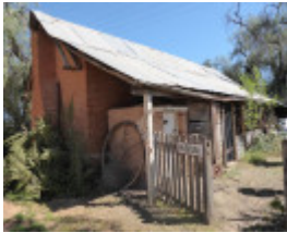
Store & cellar building Sept 2015.JPG