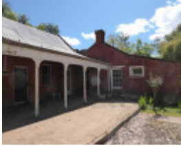
1854 addition with 1846 homestead in background Sept 2015.JPG