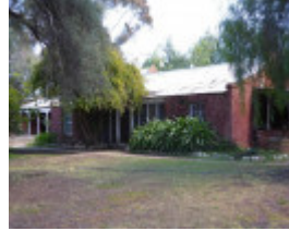
original 1846 homestead Sept 2015.JPG