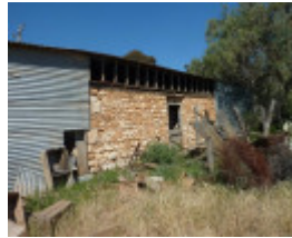
limestone wall in shed Sept 2015.JPG