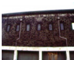
former carlton brewery bouverie street facade sw may1999