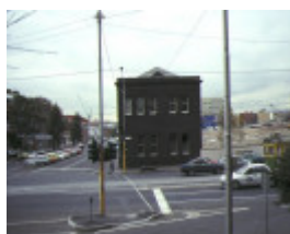
carlton brewery 1990 view