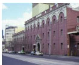
carlton brewery external front swanston street