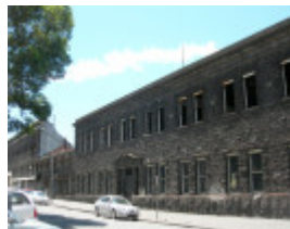
FORMER CARLTON AND UNITED BREWERY SOHE 2008