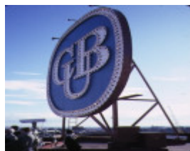
carlton brewery sign