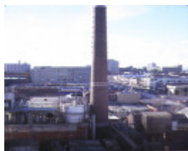
carlton brewery tower view