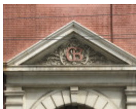
Carlton and United 009.JPG