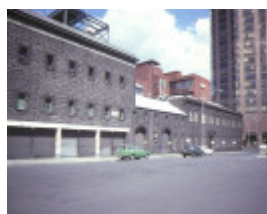
carlton brewery bouverie street carlton side view