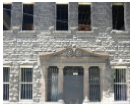
FORMER CARLTON AND UNITED BREWERY SOHE 2008