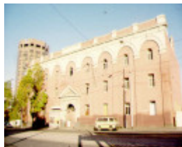
1 former carlton brewery malthouse swanston street facade sw may1999