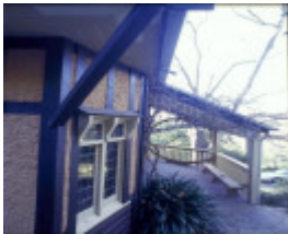
chadwick house the eyrie eaglemont south west verandah she project 2003