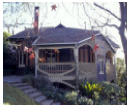
chadwick house the eyrie eaglemont south elevation she project 2003