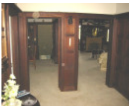
h01009 desbrowe annear house 38 the eyrie eaglemont entry hall feb mz