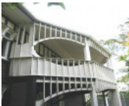
h01009 desbrowe annear house 38 the eyrie eaglemont piazza detail feb mz