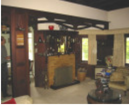
h01009 desbrowe annear house 38 the eyrie eaglemont living room mantle feb mz