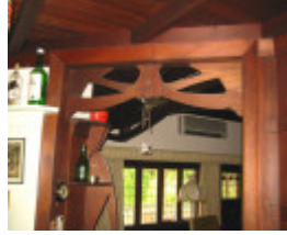
h01009 desbrowe annear house 38 the eyrie eaglemont lintel detail feb mz