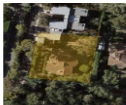
Aerial Photo 2016 Extent of Former Lalor House.jpg