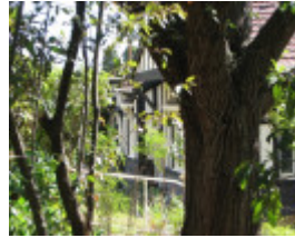
DESBROWE ANNEAR HOUSE SOHE 2008