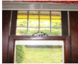
h01009 desbrowe annear house 38 the eyrie eaglemont window 02 feb mz