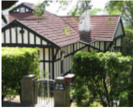
DESBROWE ANNEAR HOUSE SOHE 2008