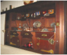
h01009 desbrowe annear house 38 the eyrie eaglemont dining room dresser feb mz