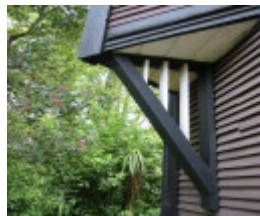
h01009 desbrowe annear house 38 the eyrie eaglemont bay bracket feb mz