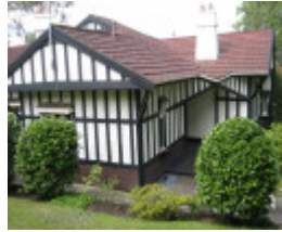
h01009 1 desbrowe annear house 38 the eyrie eaglemont 001 feb mz