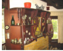
h01009 desbrowe annear house 38 the eyrie eaglemont living room mantle detail feb mz