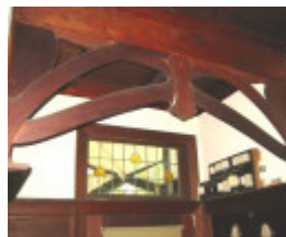
h01009 desbrowe annear house 38 the eyrie eaglemont entry detail feb mz