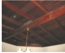
h01009 desbrowe annear house 38 the eyrie eaglemont lining room ceiling air vent feb mz