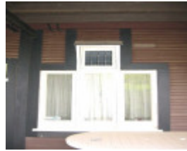
h01009 desbrowe annear house 38 the eyrie eaglemont window 01 feb mz