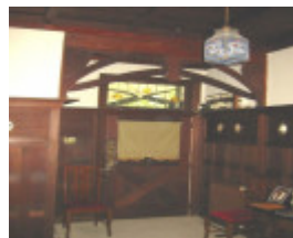
h01009 desbrowe annear house 38 the eyrie eaglemont entry feb mz