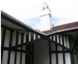
h01009 desbrowe annear house 38 the eyrie eaglemont entry eaves feb mz