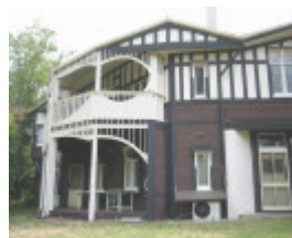
h01009 desbrowe annear house 38 the eyrie eaglemont piazza feb mz