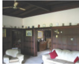
h01009 desbrowe annear house 38 the eyrie eaglemont living room feb mz