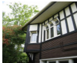
h01009 desbrowe annear house 38 the eyrie eaglemont bay window feb mz