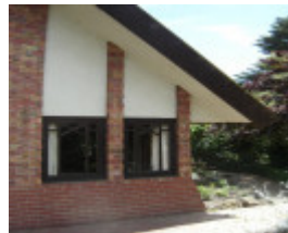
H2091 Lippincott House Glenard Dr Heidelberg Window Detail 02 Nov2005 mz