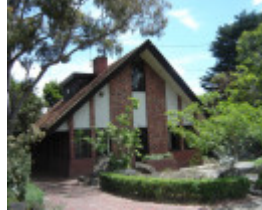
H2091 01 Lippincott House Glenard Dr Heidelberg Front Elevation 01 Nov2005 mz