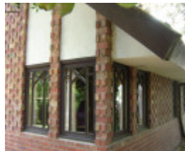
H2091 Lippincott House Glenard Dr Heidelberg Window Detail 04 Nov2005 mz