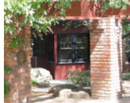
LIPPINCOTT HOUSE SOHE 2008