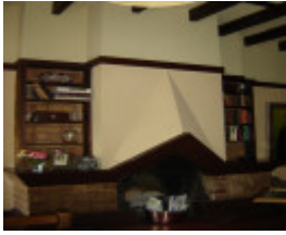
H2091 Lippincott House Glenard Dr Heidelberg Fireplace Living Room Nov2005 mz