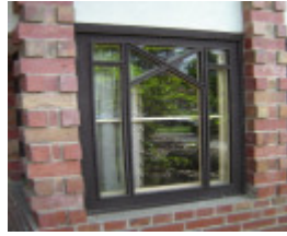
Lippincott House Glenard Dr Heidelberg Window Detail November 2005