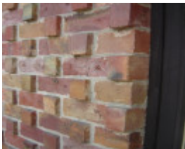
H2091 Lippincott House Glenard Dr Heidelberg Brick Detail Nov2005 mz