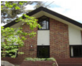
H2091 Lippincott House Glenard Dr Heidelberg Front Elevation 02 Nov2005 mz