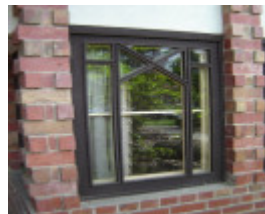
H2091 Lippincott House Glenard Dr Heidelberg Window Detail 01 Nov2005 mz