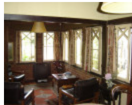
H2091 Lippincott House Glenard Dr Heidelberg Windows Sitting Room Nov2005 mz