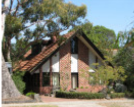
LIPPINCOTT HOUSE SOHE 2008