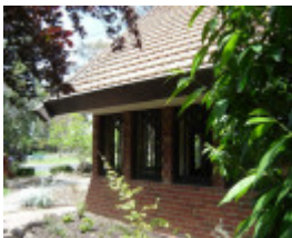
H2091 Lippincott House Glenard Dr Heidelberg Corner Window Detail Nov2005 mz