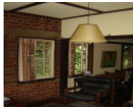
H2091 Lippincott House Glenard Dr Heidelberg Sitting Room Nov2005 mz